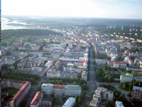
LAHTI CITY CENTRE