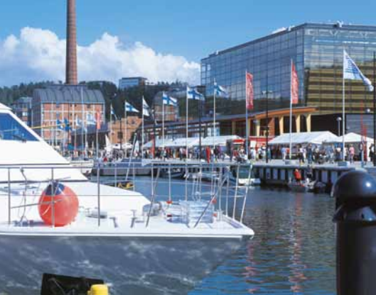
LAHTI HARBOUR AND SIBELIUS HALL